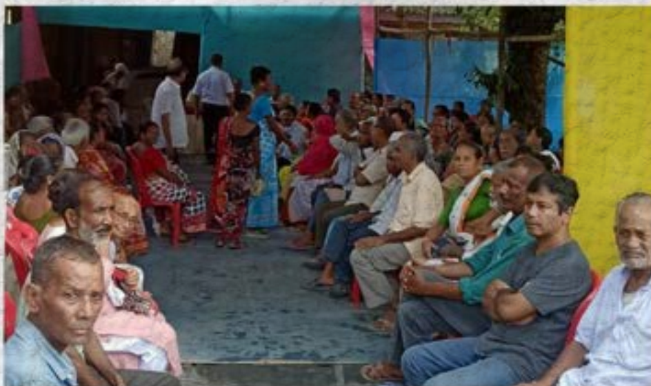
LIONS CLUB OF JAGIROAD