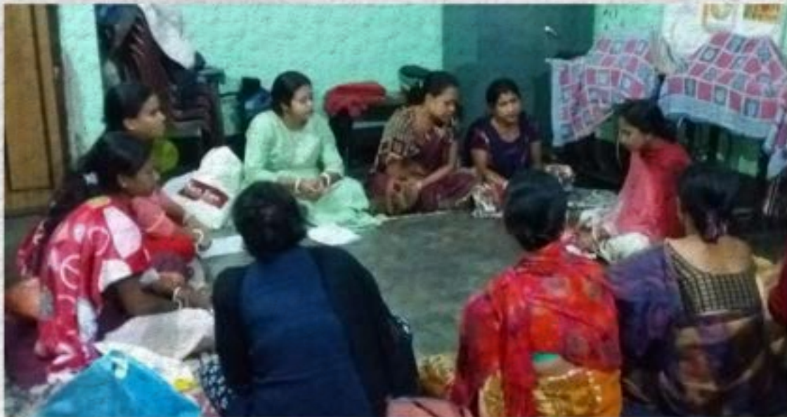
LIONS CLUB OF GUWAHATI SAHYOG